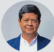
Candra Darusman IP Observer and former Deputy at World Intellectual Property Organization (WIPO)