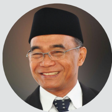
Prof. Dr. Muhadjir Effendy Minister of Education & Culture as The Keynote Speaker