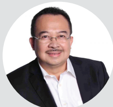
Prof. Rhenald Kasali Author, Academic, Businessman